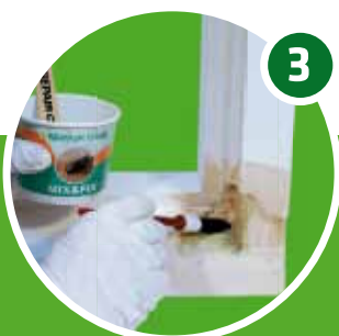
Prime with DRY FIX®