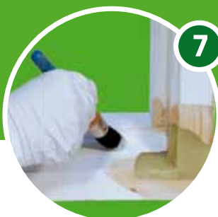
Apply paint finish