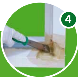
Apply DRY FLEX®